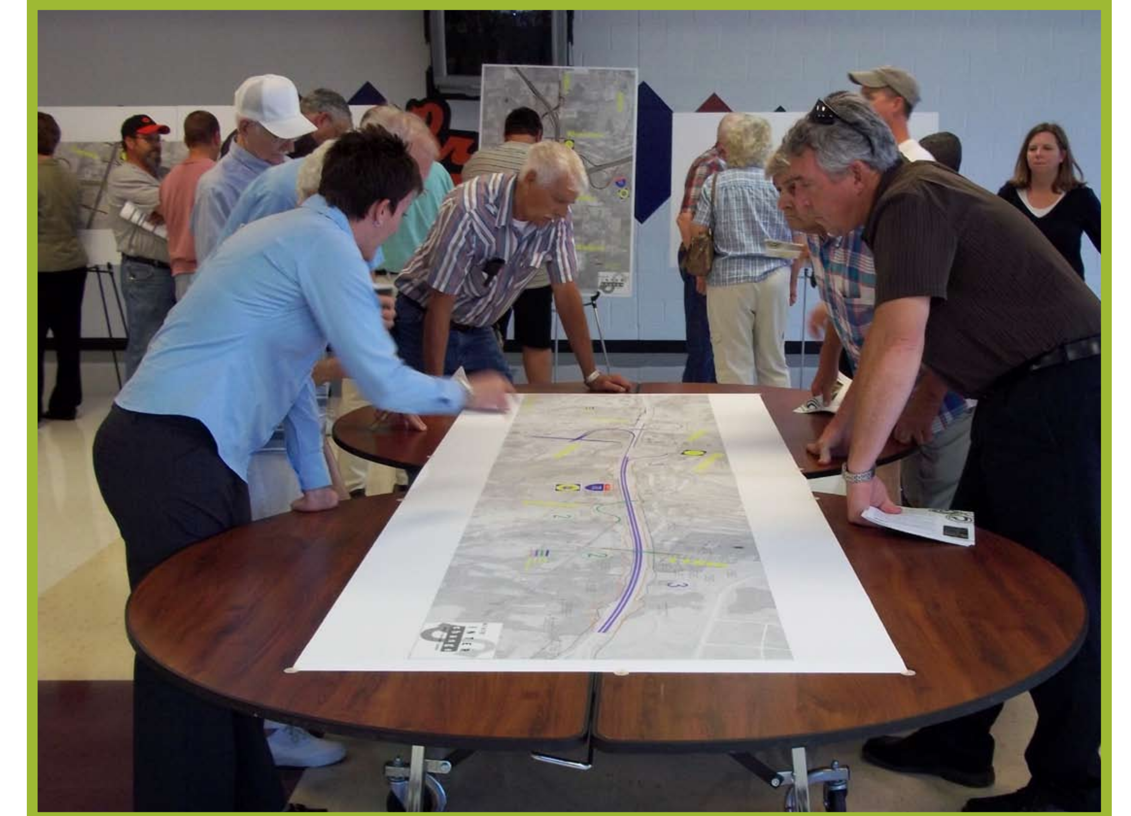
Public open house participants discuss plans for improving the K-7 and I-70 Interchange