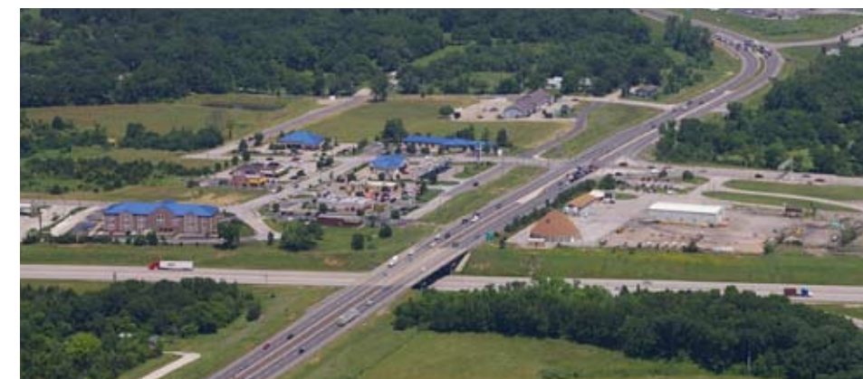
K-7 over I-70 in Bonner Springs, Kansas

The ultimate K-7 and I-70 Interchange project will respond to the area's increasing traffic demands and economic development needs, while improving safety. Throughout the interchange design process, KDOT will examine: what growth, development, and traffic is happening at the interchange TODAY, what may occur in the future (TOMORROW), and how KDOT can work TOGETHER with the community to complete the design and plan for construction.